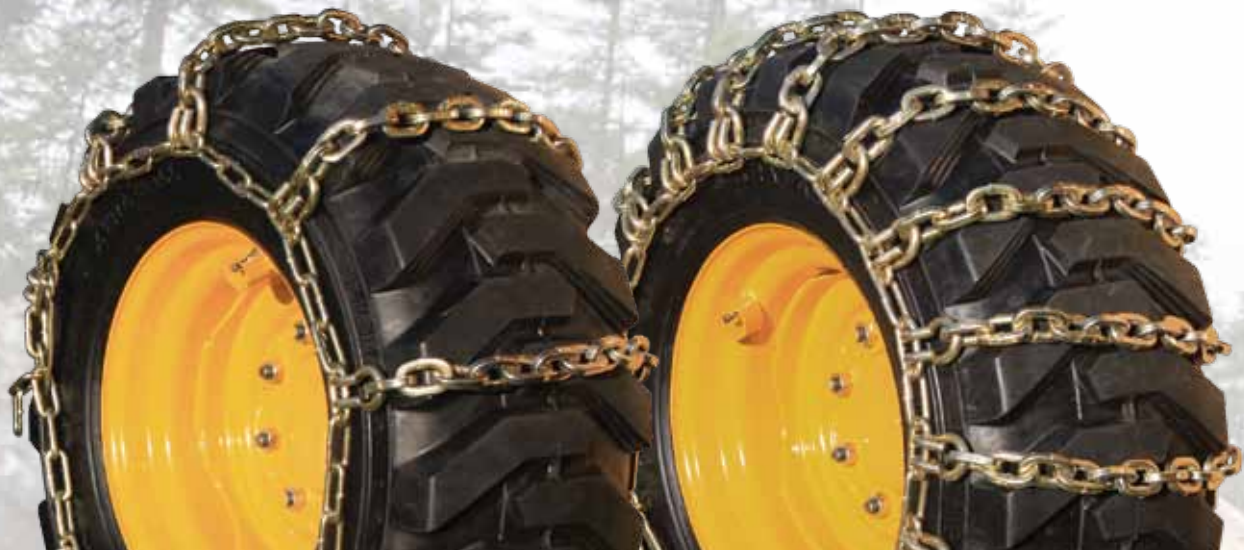
Predator™ Skid Steer 4 Link 2 Link*